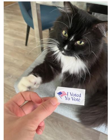
Above: GENA VP Heather's cat Zelda approves of Galindo's voter turnout!

Incredibly, Galindo (precinct 416) had an overall ~34% voter turnout rate* , an unprecedented level which both exceeded the Travis county-wide rate of ~30%, and our precinct's turnout in the 2024 primaries!