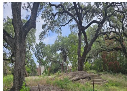
The Vacant Lot at 610 Cardinal Lane and its Lonesome Staircase.