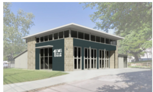
New EMS station design at 3616 S 1st St

EMS personnel had been working from a cramped trailer on the property during construction, so the new space will be a welcome change. With room to house two ambulances and a commander , plus potential future resources like an advanced life support (ALS) squad, the station is better equipped to respond quickly and efficiently to neighborhood emergencies.