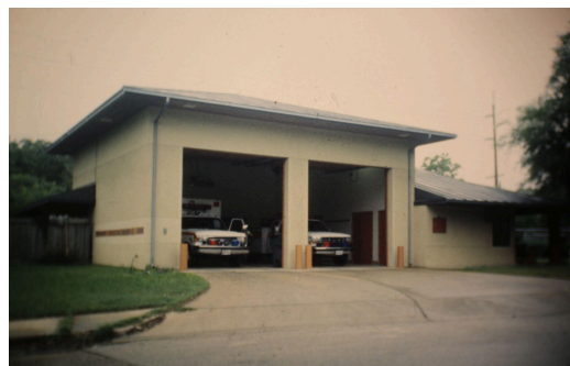
BEFORE: Former EMS station bay

So whether you're a longtime Galindo neighbor or new to South Austin, keep an eye out—EMS Station One is back, better than ever, and ready to serve.